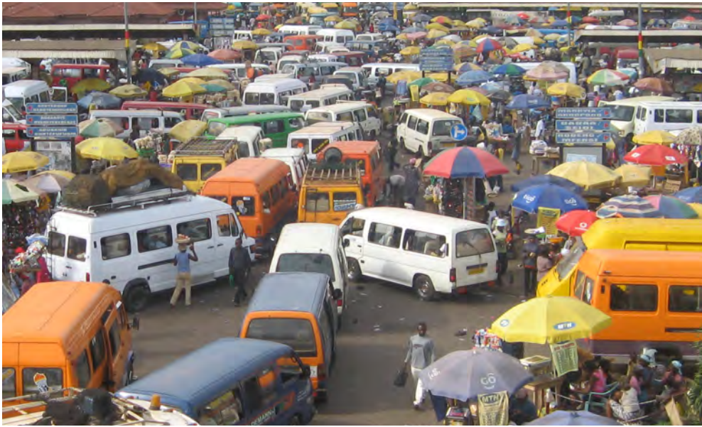
A lively and rather caotic lorry park. This is near the big market in Kumasi.