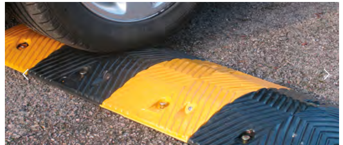
Speed bumps are one of the simple technical issues to reduce too high speed.

While approximately 80% all traffic accidents in Ghana can be attributed to drivers' error, campaigns could be made to reduce the drivers' acts through safety education. Television and billboards have been cre-