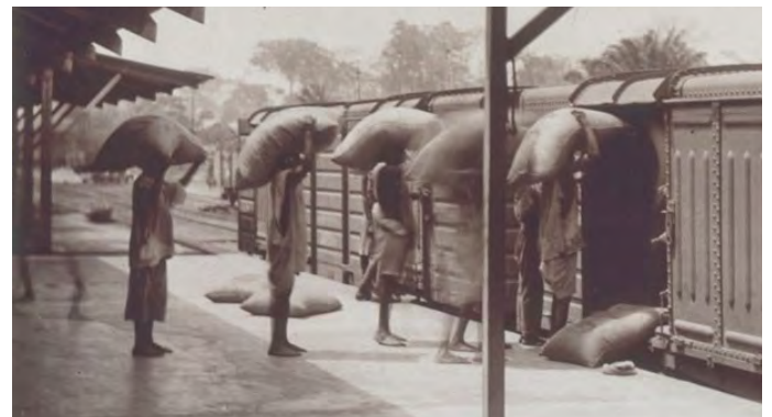
Loading cocoa in railway waggons around 1935..

A new line was planned to go from Accra and Kuma-