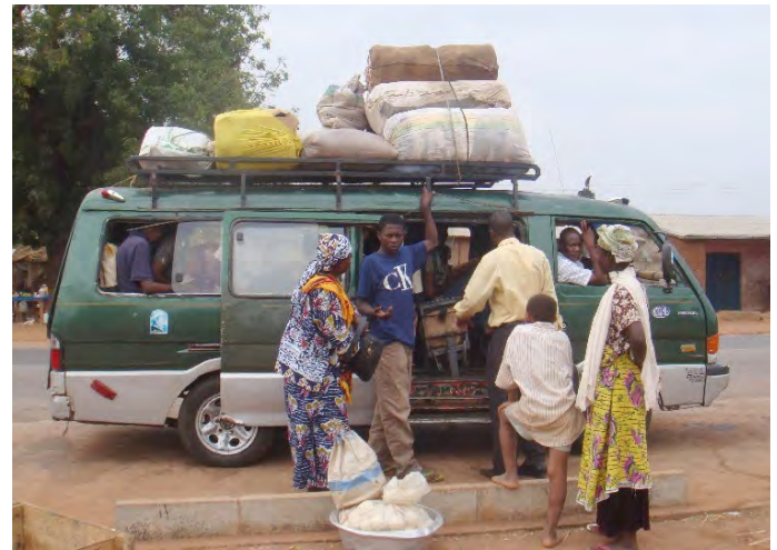
This tro-tro has been the standard transport vehicle for several decades. They are second-hand cars from Europe that can get a new life in Ghana.

The building of the Great Northern Road is said to be important. It started in Kumasi and ended in the then-small village, Tamale, now the third largest town in Ghana. Its 378 km connected the railway city Kumasi to the north. The construction started around 1907 and was probably rather primitive based partly on non-paid locals forced by their chiefs (Ntewusu, 2014). The road was finished around 1920, if we can say that a road that