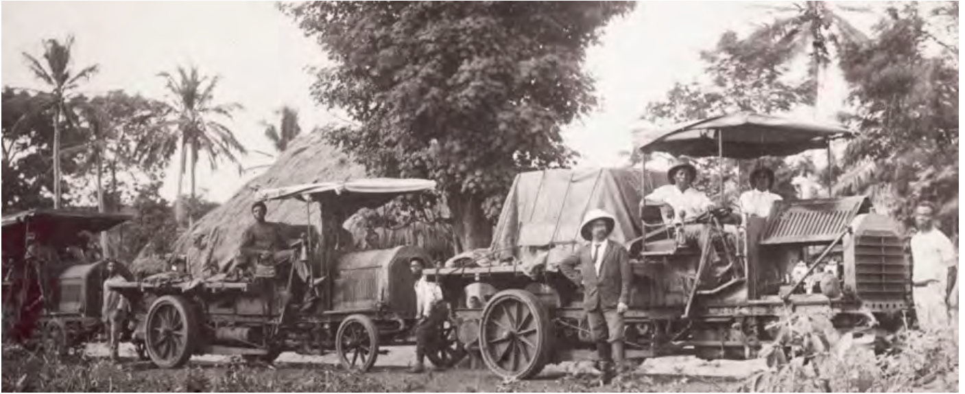
Half ton Daimler trucks at the Basel Mission Trading Company collection place in Dodowa north of Accra around 1910..

selling food and similar goods is the only service on the open place. The park is not organized in any way. None of the vehicles has a fixed place but are randomly parked around. The truck assistants shout the destination of their vehicles several times a minute. When passengers have located their vehicle they can sign on and reserve their seat by sitting in it. Partially filled trucks can wait for more passengers, lasting many hours outside the peak-hours, probably in a sunbaked vehicle and in danger to lose his place if he is going away on an errand.