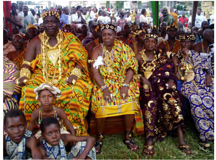
The traditional chiefs are not only for feasts and celebrations. They have a strong power in the local society.

The road sector had the same problems. The construc-