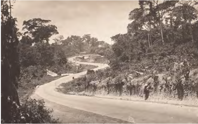
One of the first tarred roads in Ghana for cars and trucks (Mampong).

sulted in a reduction of the expenditure to the half for the hauling with trucks (Gould, 1960). The more efficient truck transportation reduced the transportation season from seven to three months. The need for storage and drying capacity was significant reduced.