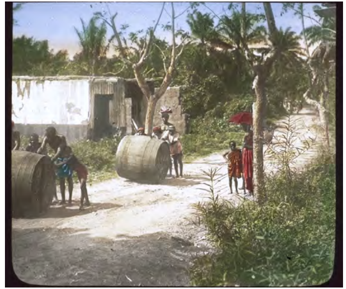
Transport of barrels with palm oil. Photo around 1915.

Organizational initiatives were taken to make better plans for construction and maintenance. One of the initiatives was the establishment of the Ghana Road Fund in 1985 to provide a secure source of funding for road maintenance. The revenue was derived from a fuel levy on petrol (that became the dominant income on 90 % of the income), from road, bridge and ferry tolls and vehicle examination fees. Since 1998, further income has come from transit fees. For its first few years, the fund had huge problems with its economy where less than 35% the required funding came in. Most of the problems occurred because the fund lacked effective oversight over its budget, it got no feedback from agencies on the use of funds, it had no monitoring and revenues collected in the regions were delayed and some of those funds “lost their way” into the consolidated fund. A restructuring in 1995 should help the Fund for instance with a