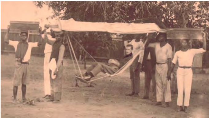
A missionair ready to a travel through the bush in a modern type of hammock. Around 1925.

There has been a strong state since approximately 1600, with an increasing bureaucracy to handle the bookkeeping, administer land and handle discrepancies. A local administration based on uniform rules was established around 1800; gradually it became based on a democratic engagement of the general population. By the early 1900s, the political system was a functioning democracy on all levels.