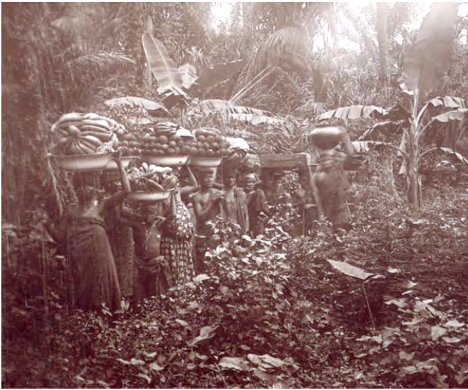
A typical path through the rainforest. Photo around 1910.

The economy forced the politicians to stop building and maintaining roads in 1961. The situation worsened for many years, with its lowest point in 1983.