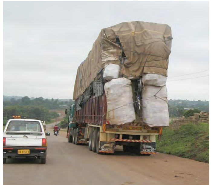
Overload is a severe problem in a country with few resources. The roads are still under destruction in spite of laws against overloading.

The poor farmers want to have transported their crops as cheap as possible, but it is too expensive for some of the world's poorest countries to pay for road rehabilitation. It is estimated that transport costs for eastern and southern Africa are four to five times higher than that of