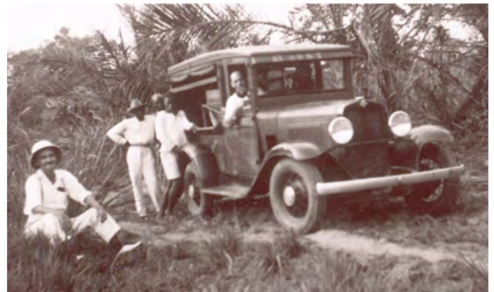
Touring in the bushland around 1930.

Most motorized vehicles in Ghana are second-hand cars from Europe. The import to the countries in West Africa started in the 1980s with 10,000 cars a year to more than 500,000 a year around 2000, presenting a value of more than US$1 billion. The first imports were made by European tourists, development specialists or young African students in Europe, and the cars were driven through the Sahara or as additional freight on regular cargo ships. Today the business is more professional with shipping lines in regular trade between Europe and Africa. Only a few shipping companies handle the vessels that operate on the Hamburg-Amsterdam-Antwerp-Le Havre route where the cars are loaded