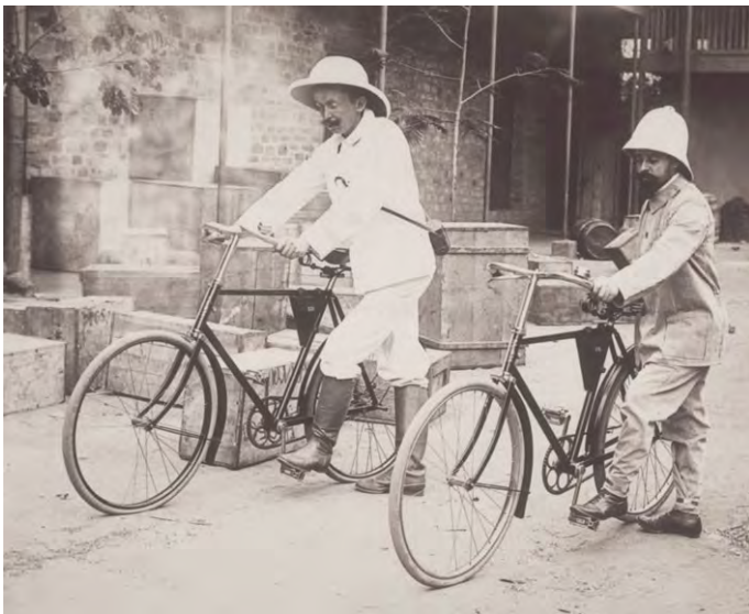
Two missionaries in Cape Coast around 1903..

The evidence that 1918 began a new age also can be seen in Zambia. Carriers were used by the British military until after World War I when the military began to use very functional light Ford T cars. Those cars could drive longer distances than the approximately 25 km the native carriers could walk. It seems that the road condition year around and an efficient service system