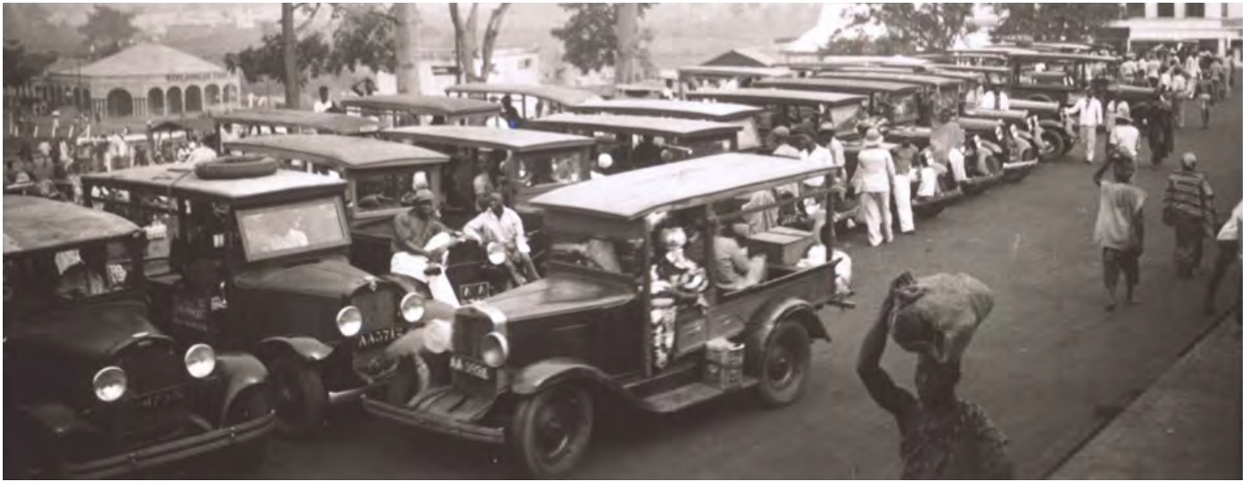
A lorry park in the 1930s.