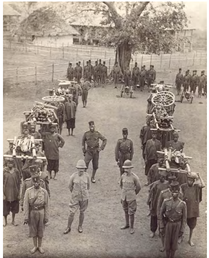
The British military used head portering for its transport up to 1920. Photo around 1900.

The climate for road and railway construction is rather convenient. No heavy rains to destroy a road and with a lot of gravel in the soil to build constructions with a fair drain.