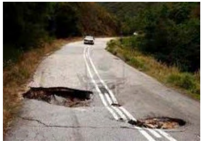
Only 17 % of the roads in Ghana have asphalt. Here is one of them but with some large potholes - unfortunately very common.

The real expansion of the car traffic happened after World War II. After 1957 people were allowed to buy cars again without any regulation. After a few years, most Danish households had a motorized vehicle. The result was a constipation of the roads and a lot of new motorways and road systems were built. Even the rise of new cars was reduced because there are regularly traffic jams around the big cities. All roads in Denmark are paved.