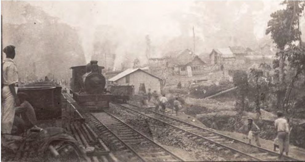
The railway short after the opening of the track between the harbor Sekondi and Kumasi in 1904..

year-round and November is the wettest month with 79 mm rain. Well drained roads can be used nearly all year.